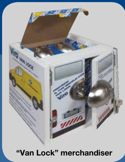
“Van Lock” merchandiser

Body: one-piece, electropolished stainless steel, oval shape without edges.